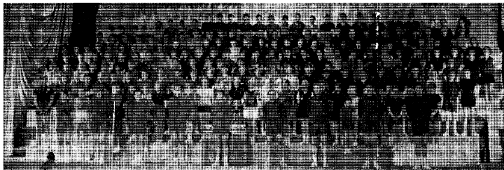
THE FINALISTS PARADE FOR THE PRESENTATION.

CHINA are to make a tour of France after the World Championships.